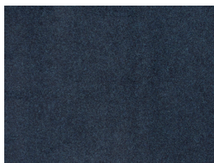
5507 Blauw 4 m