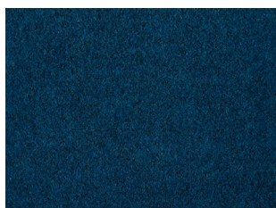
5546 Indi Blue 4 m