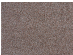
7760 Chevreuil 4 m