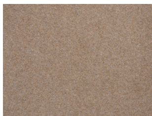
1770 Burro 4 m