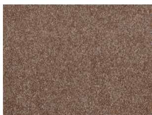
7764 Acorn 4 m