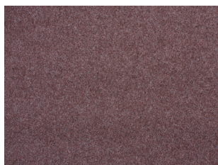
3372 Crushed Berry 4 m