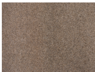
1142 Lichtbeige 4 m