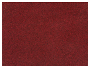
3353 Rood 4 m