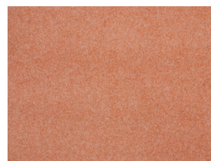
7719 Roest 4 m