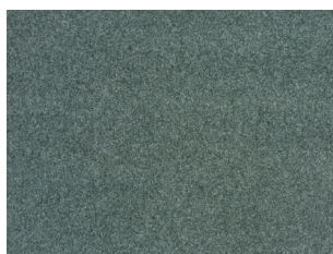
6672 Olive 4 m