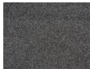
2236 Antraciet 4 m