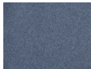
5539 Blauw 4 m