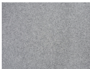
2216 Lichtgrijs 4 m